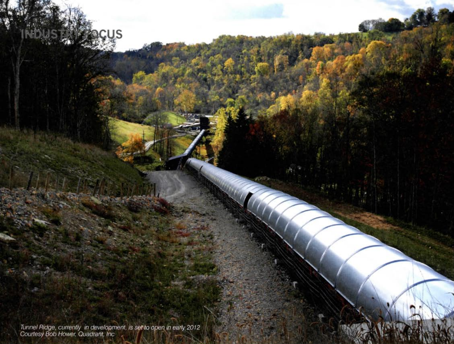
Tunnel Ridge, currently in development, is set to open in early 2012

Set to open in early 2012 at 5.5 million tons per annum following the final finishing touches of its development, Tunnel Ridge is not even in full production mode yet and it is already making a name for itself as one of the most anticipated new longwall operations. After securing a reserve in excess of 70 million tons in the Pittsburgh 8 seam – a rare feat in itself – development at the West Virginia mine’s Walker Slope was announced in September 2008.