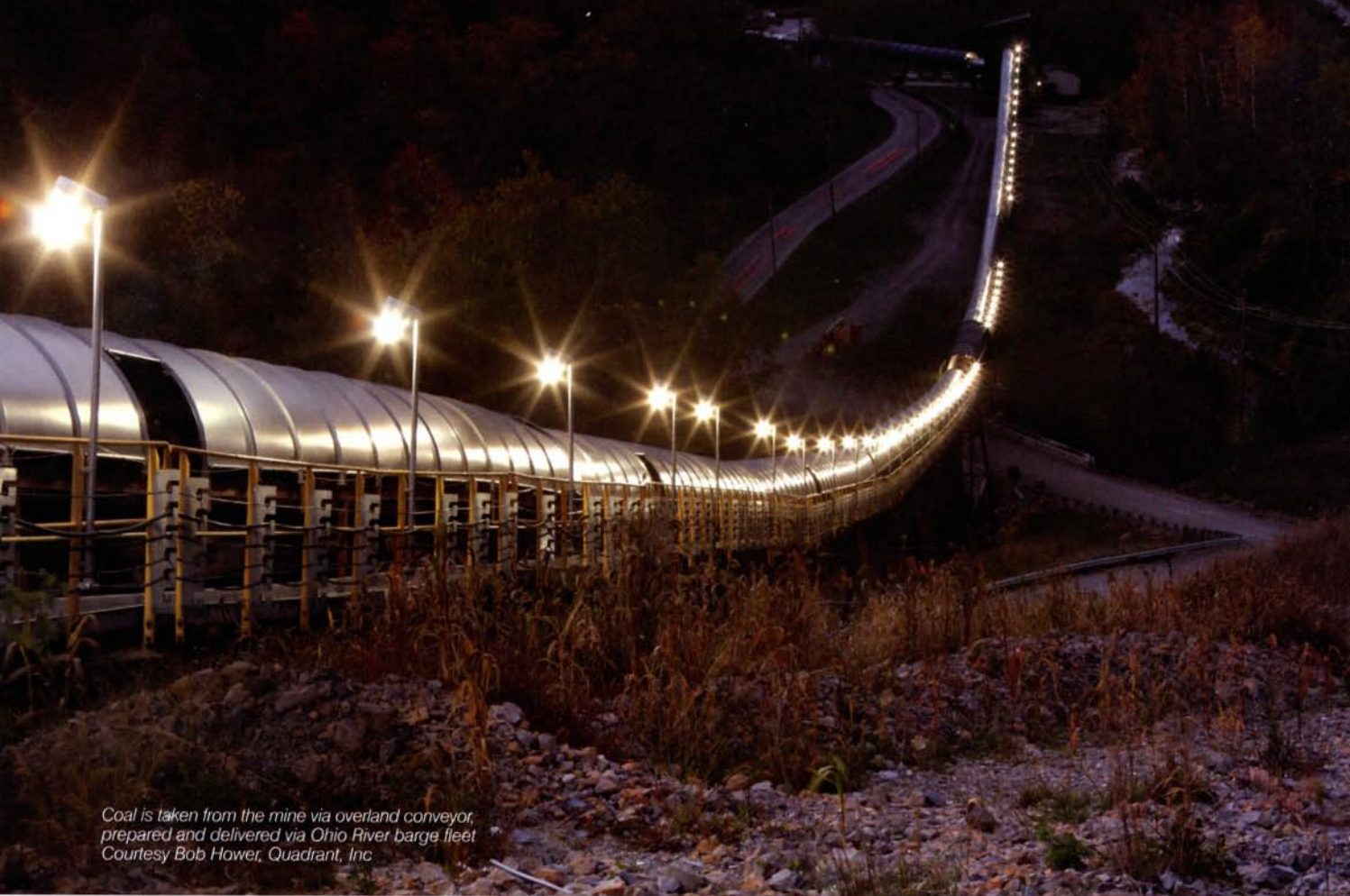
Coal is taken from the mine via overland conveyor, prepared and delivered via Ohio River barge fleet.

commences production, the transitory 200HP main fan will be changed out with an 8ft, 2000HP exhausting fan with a 1000HP bleeder fan.