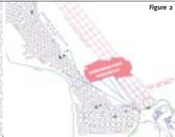
Figure 2 Mining originating from four portals intercepted uncharted old workings. Directionally drilled in-seam boreholes were developed to derive the lateral extent of the workings.